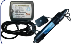
UV Ozone system - ultimate water management system