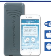
Optional feature - SmartLink to your phone