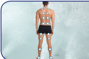
Powerful high flow massage jets