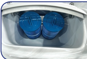
Top loading filters - easy to clean