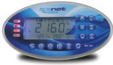
Australian smart SpaNET SV control system