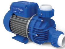
Reliable "Energy Smart" high flow filtration pump