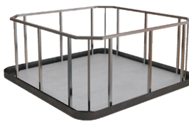
Wraparound base keeps vermin and weather out