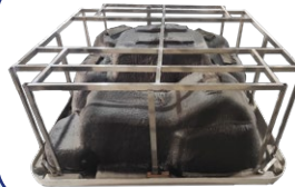
Stainless Steel frame with side and seat supports