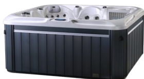
Thermo-wood maintenance free cabinet