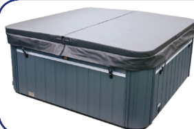
High density lockable cover