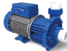
SpaNET - low running cost efficient water flow pump.