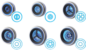
Premium self cleaning, LED "Aqua-ssage" Jets